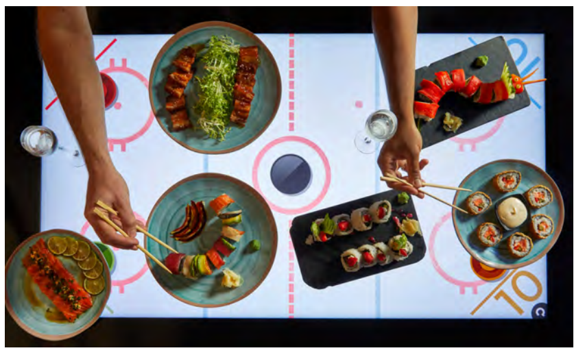
or all join in together, perhaps a 4 player game of air hockey?

inamo also boasts 2 award-winning Games Rooms with 150 inch wall projections, games consoles, and karaoke systems with over 90,000 songs; perfect for gaming, live TV & sports, and a sing-along; with their own private bars & private dining options.