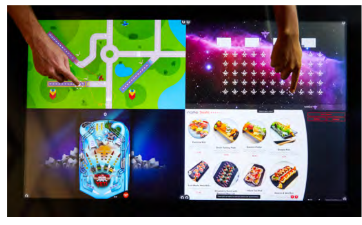
split the table in 4 so everyone can choose what to play or order

We've recently launched brand new touch-sensitive tables with over 20+ new games including 4-player air hockey, pool, space invaders, archery & many more. The table experience is unlike anywhere else in London or beyond.